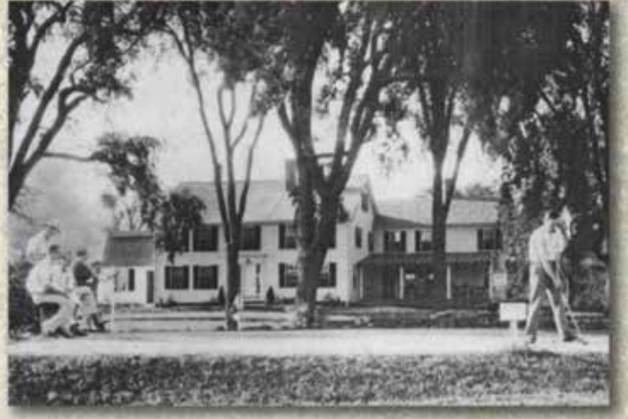
Challenging Golf Since 1931